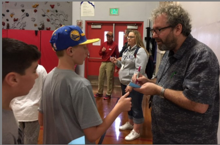
Great job, everyone!