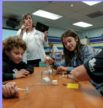
Our students engage in hands-on STEM projects for 5 days at STARBASE.