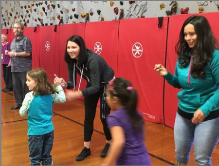
Run For Astor!